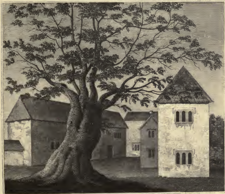
Another View; with the Locust Tree.